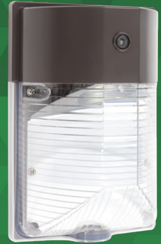
15W / 17W / 25W