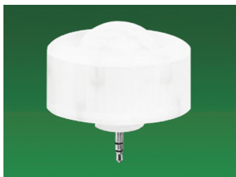
MULTI-LEVEL MOTION SENSOR Center-mounted plug & play multi-level motion sensor detects occupancy in an area for additional energy savings.