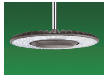
PENDANT MOUNT A 3/4" conduit entry point ensures easy pendant installation.