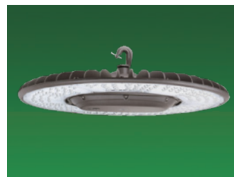
HOOK MOUNT Included hook mount features an anti-shedding screw for added security.