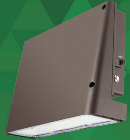
SELECTABLE POWER & CCT: 38W / 65W