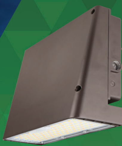
SELECTABLE POWER & CCT: 100W